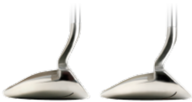
Acer XK Chipper with 37° loft