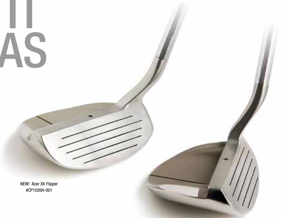
NEW! Acer XK Flipper #CP1026H-001